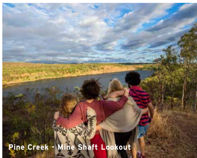
Pine Creek - Mine Shaft Lookout