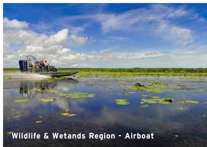
Wildlife & Wetlands Region - Airboat