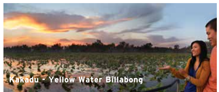
Kakadu - Yellow Water Billabong