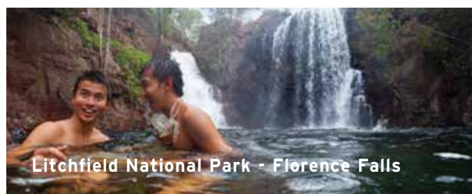
Litchfield National Park - Florence Falls