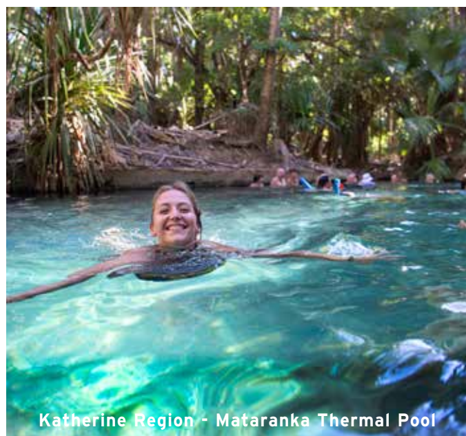
Katherine Region - Mataranka Thermal Pool