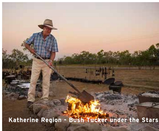
Katherine Region - Bush Tucker under the Stars

On your way back into Darwin, check out the famous Birds of Prey show and Ooloo Sandbar at the internationally renowned Territory Wildlife Park. Stop into the Berry Springs Nature Reserve to cool off in the natural springs. Return to Darwin for a sunset harbour cruise, a visit to the markets or a movie under the stars.