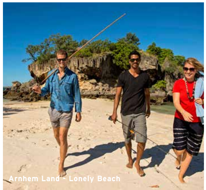
Arnhem Land - Lonely Beach

Take an early morning scenic flight over the wetlands and escarpments. Drop into Bowali Visitor Centre and see the interpretive display's and Art gallery. Visit Ubirr Aboriginal Art Site. Stop to see the abundance of native birdlife at Mamukala Wetlands.