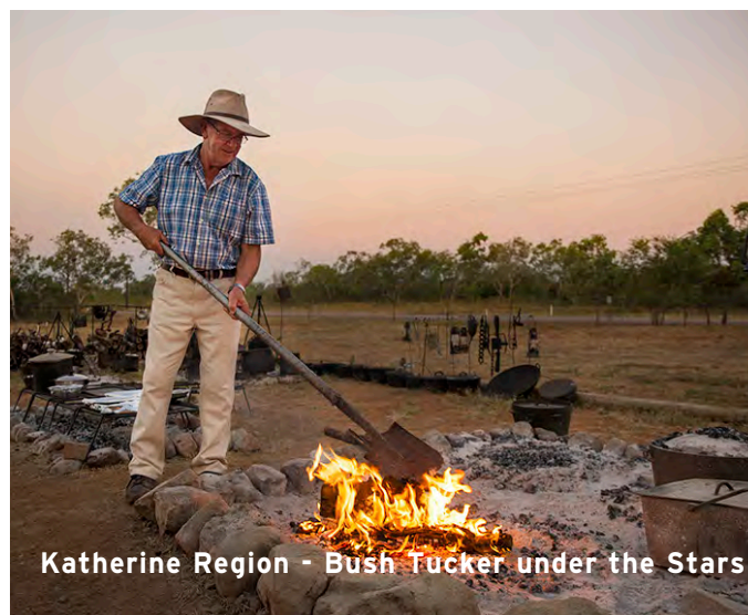
Katherine Region - Bush Tucker under the Stars

On your way back into Darwin, check out the famous Birds of Prey show and Ooloo Sandbar at the internationally renowned Territory Wildlife Park. Stop into the Berry Springs Nature Reserve to cool off in the natural springs. Return to Darwin for a sunset harbour cruise, a visit to the markets or a movie under the stars.