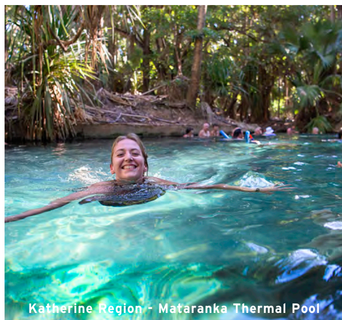
Katherine Region - Mataranka Thermal Pool