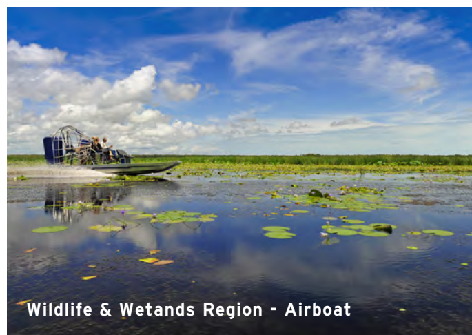
Wildlife & Wetlands Region - Airboat